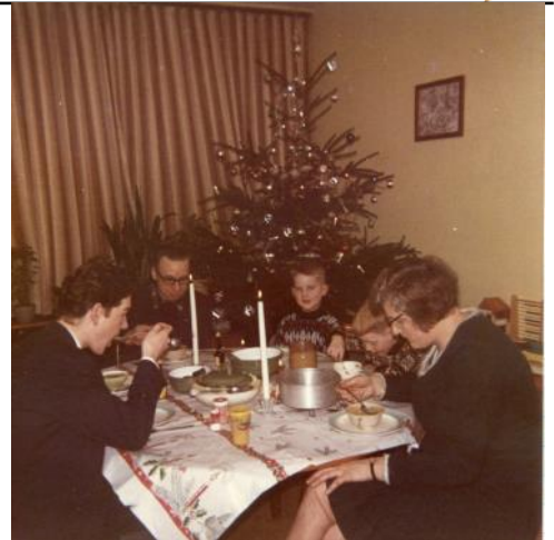
Typical Dutch Christmas dinner 1967 .

Christmas is one of the most important Christian and cultural holidays of the year, but what is the true meaning of Christmas? For Christians, the true meaning of Christmas is the celebration of the Saviour, Jesus Christ.