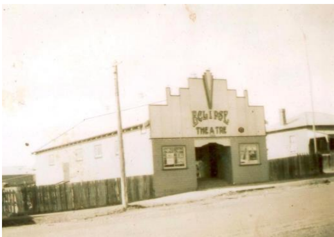
First Eclipse Theatre built by Carl Baer in 1930.

The workmen are busily engaged completing the building, which on the opening day, August 31, will equip Deepwater with one of the finest theatres in the country districts of the State.