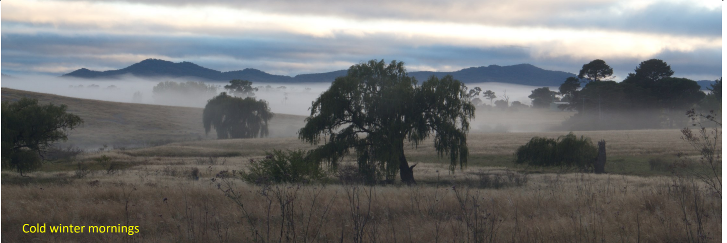
Cold winter mornings