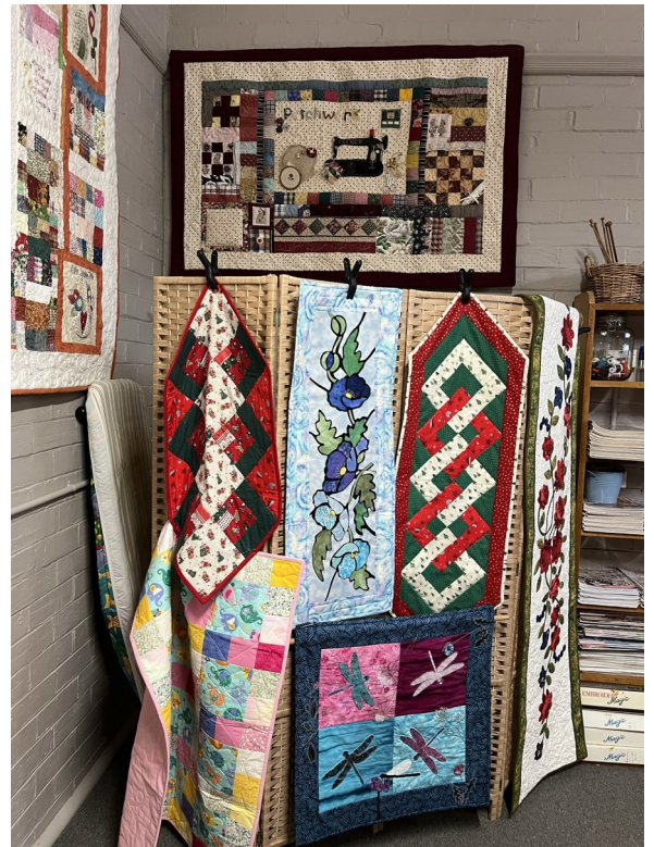
Another photo from Heartwarming handmade in Deepwater.